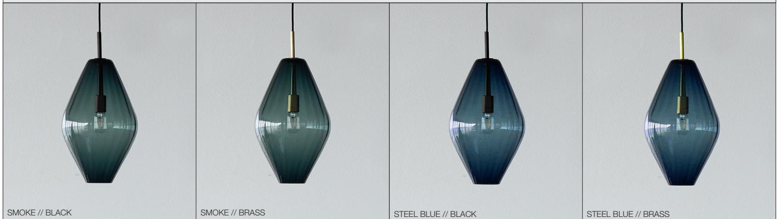
SMOKE // BLACK