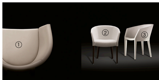
1 Margot 60970 hazel saddle leather 2 Margot 60971 lavello 8710 fin.54 3 Margot 60970 hazel saddle leather