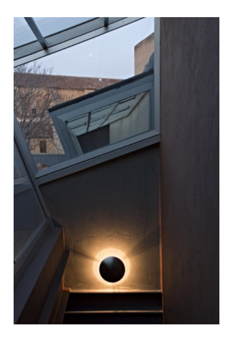
(B) Disco medium