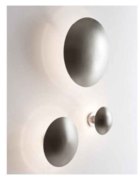
(A) Disco small, (B) Disco medium, (C) Disco large

A steel disc hides the light source and diffuses it around the opaque circle. The light is reflected on the wall and creates a halo around the disc, rather like the luminescence of stars during an eclipse.