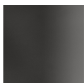
GLOSSY PAINTEDBRO WN NICKEL

FINISHINGS\SWIVEL BASE\GLOSSY PAINTEDBROWN NICKEL (1)