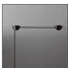
AGGREGATO SOSP ROSONE DECENT A086000