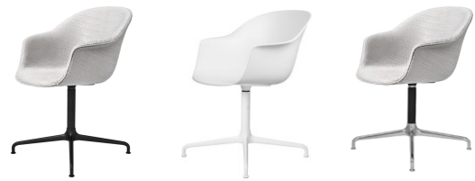
// 4 Star Base - Black // 4 Star Base - Soft White // 4 Star Base - Chrome/Black