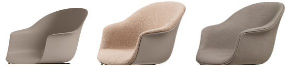
Unupholstered // Front upholstered // Fully upholstered