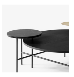
Brass, Nero Marquina & black lacquered ash