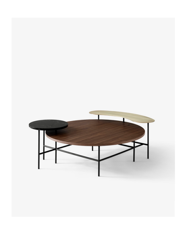
103cm / 40.6in