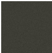
0799M Metallic grey finish