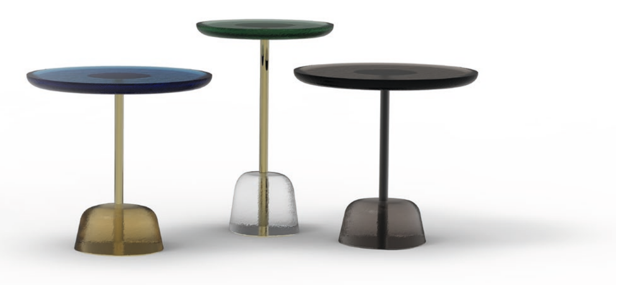
TABLE. DANCE. PARTY.

Sebastian Herkner's distinctively tall, skinny side table series pina is inspired by the abstract turns and twists of the famous Pina Bausch dance theatre. The basic figurine with base, rod and top shines in different combinations of aqua blue, transparent, green and light grey.