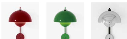
→ Vermilion Red → Signal Green → Chrome-plated