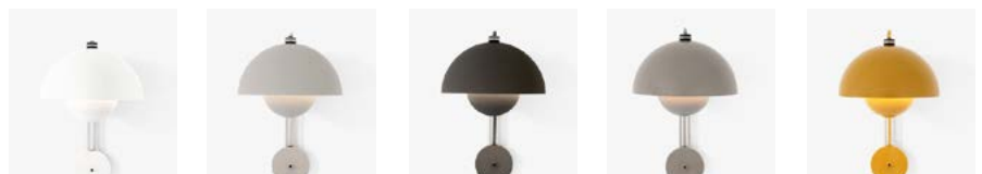
→ Matt White → Matt Light Grey → Matt Black → Grey Beige → Mustard