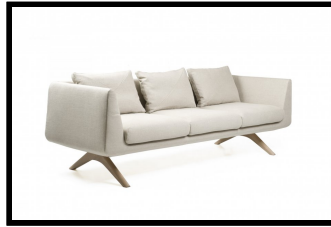
350F HEPBURN FIXED 3- SEATER SOFA