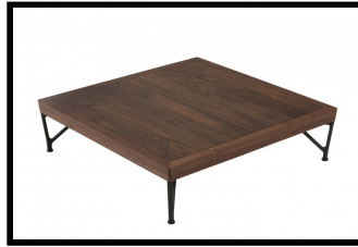
387 ARMSTRONG COFFEE TABLE