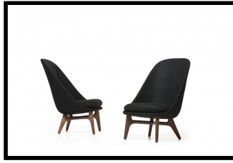
751 SOLO LOUNGE CHAIR