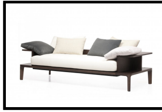
755 OPIUM SOFA