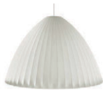
Nelson Bell Bubble Pendant Extra Large