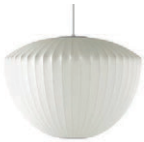
Nelson Apple Bubble Pendant Medium