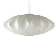
Nelson Saucer Crisscross Bubble Pendant Small/Medium